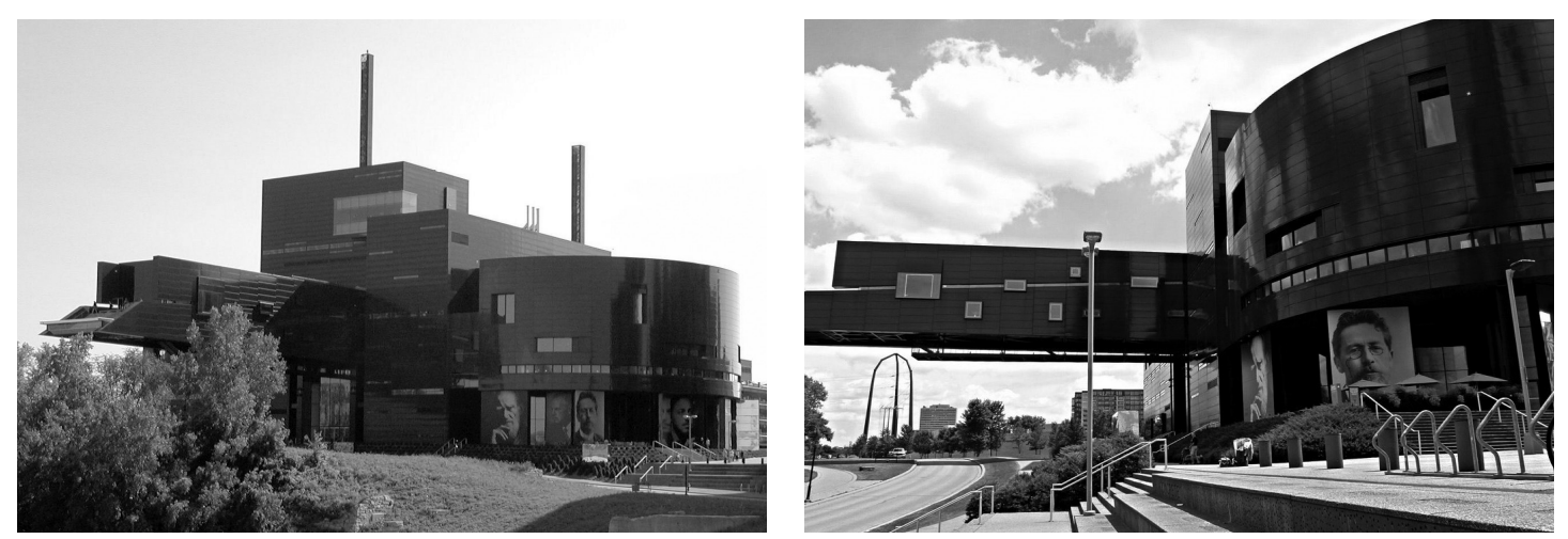
(image 1: Guthrie Theater exterior; image 2: Guthrie Theater exterior)